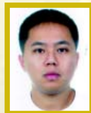
Randolph Lloyd Paray