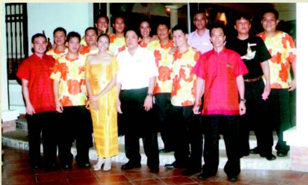
CE staff participated during the event.