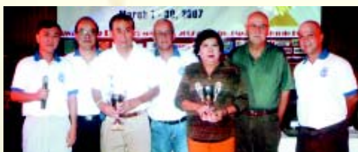
Class C Champions