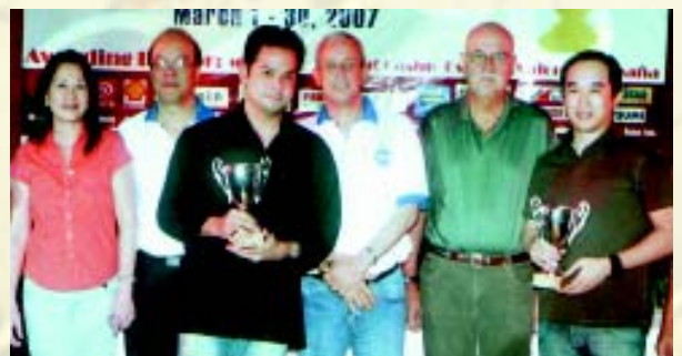
Champion Class A